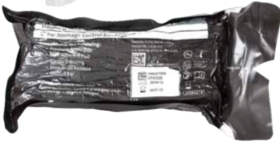
◆ PRESSURE DRESSING