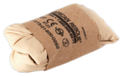
◆ TRAUMA GLOVES