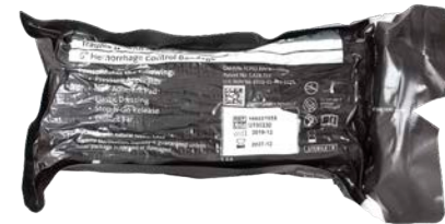
◆ PRESSURE DRESSING