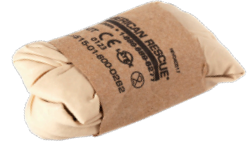
◆ TRAUMA GLOVES