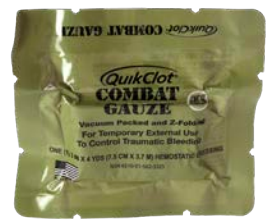
◆ QUIKCLOT HEMOSTATIC DRESSING