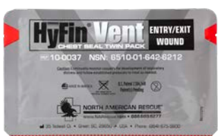
◆ CHEST SEAL