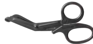
◆ MEDICAL SHEARS