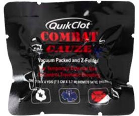
◆ QUIKCLOT HEMOSTATIC DRESSING