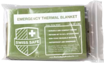
◆ HYPOTHERMIA BLANKET