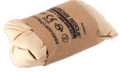
◆ TRAUMA GLOVES