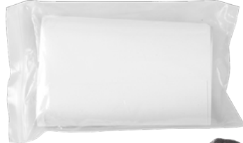
◆ PRESSURE DEVICE