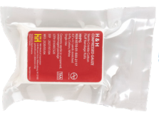
◆ COMPRESSED GAUZE