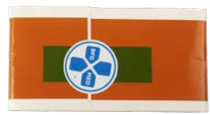
◆ FLAT FOLD TAPE