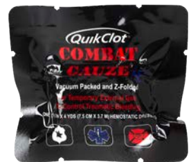
◆ QUIKCLOT HEMOSTATIC DRESSING

When folding excess medical component packaging, take care to not fold, crease or crush the product inside. Please contact Customer Service if you have questions.