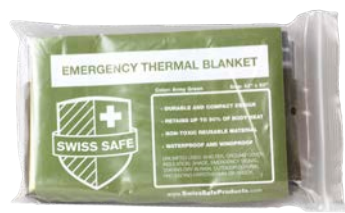
◆ HYPOTHERMIA BLANKET