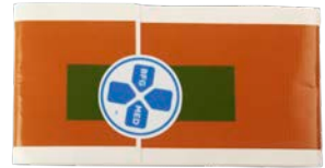
◆ FLAT FOLD TAPE