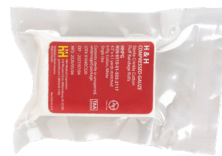
◆ COMPRESSED GAUZE