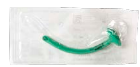
◆ NASOPHARYNGEAL AIRWAY