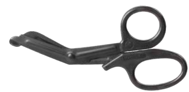
◆ MEDICAL SHEARS