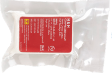
◆ COMPRESSED GAUZE