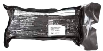
◆ PRESSURE DRESSING