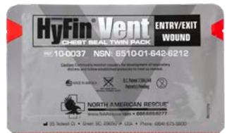
◆ CHEST SEAL