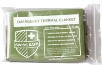
◆ HYPOTHERMIA BLANKET