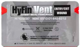
◆ CHEST SEAL