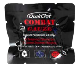
◆ QUIKCLOT HEMOSTATIC DRESSING