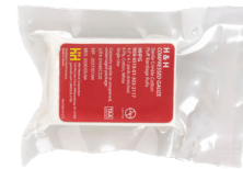
▶ COMPRESSED GAUZE