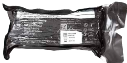
▶ PRESSURE DRESSING