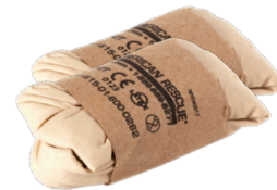
▶ TRAUMA GLOVES