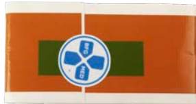
▶ FLAT FOLD TAPE