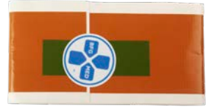
◆ FLAT FOLD TAPE