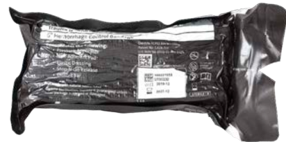
◆ PRESSURE DRESSING