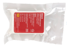
◆ COMPRESSED GAUZE