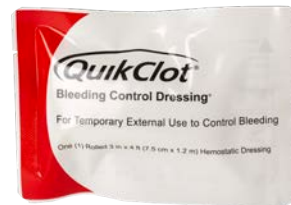
▶ QUIKCLOT HEMOSTATIC DRESSING