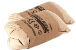
◆ TRAUMA GLOVES