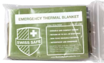
▶ HYPOTHERMIA BLANKET